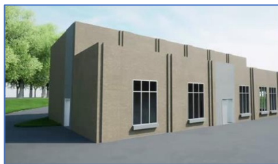
Allen Pump Station